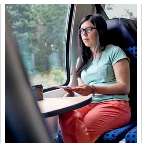
Go exploring: the semester ticket often allows vou to travel through the region for free.