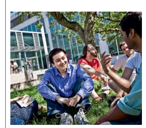
Global: German bachelor's and master's degrees are internationally comparable.