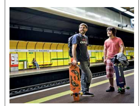
Big choice: numerous leisure activities are available, so you'll never be bored.