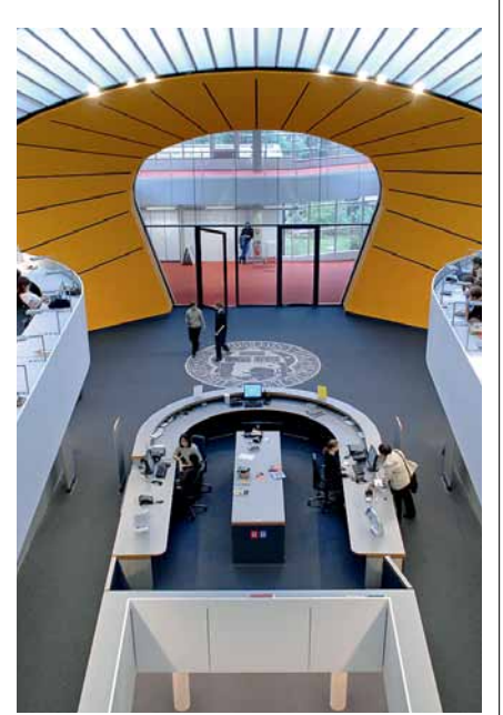
Centres of learning: German universities give you the best possible preparation for your degree.