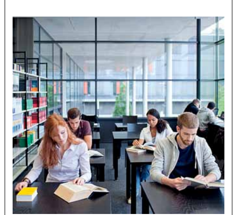
Hard work pays: a scholarship allows you to finance your studies.