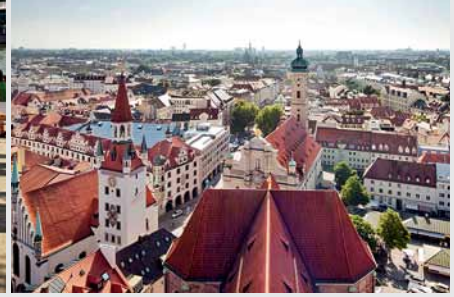
Every city has its own particular face – such as Frankfurt am Main, Tübingen and Munich.

The university's surroundings play a key part in choosing the right place to study. Do you prefer the vibrancy of big-city life with cinemas, theatres and trendy districts, or do you feel more comfortable in a smaller town? Universities in large cities tend to offer a wider range of subjects, while arguments in favour of those in smaller towns include the short distances from A to B.